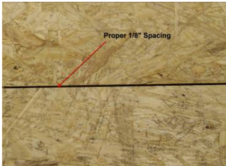
Correct installation of Advantech T&G Edge

FORCING T&G EDGES TO FIT TIGHTLY TOGETHER CAN DAMAGE THE PANELS AND VOID THE WARRANTY. T&G EDGES ARE DESIGNED TO FIT TOGETHER EASILY WHILE PROVIDING THE INDUSTRY STANDARD 1/8" GAP BETWEEN PANELS.