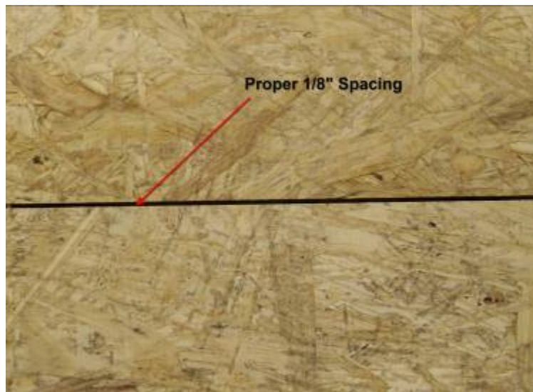
Correct installation of Advantech T&G Edge

FORCING T&G EDGES TO FIT TIGHTLY TOGETHER CAN DAMAGE THE PANELS AND VOID THE WARRANTY. T&G EDGES ARE DESIGNED TO FIT TOGETHER EASILY WHILE PROVIDING THE INDUSTRY STANDARD 1/8" GAP BETWEEN PANELS.